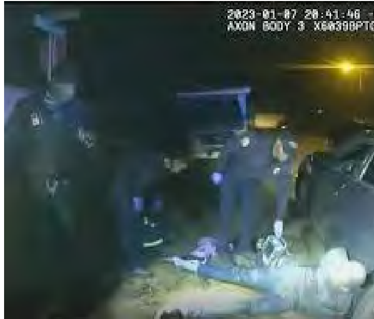
EMT Sandridge declines to use his blood pressure cuff to evaluate Tyre.