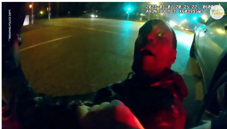
Tyre looking up at Officers terrified and confused as to why he was pulled from the car.