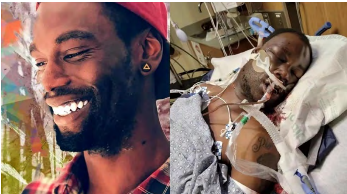
The picture on the left shows Tyre Nichols in 2021.

This lawsuit is a civil indictment under the laws of the United States against the City of Memphis, its Police Department, its Chief of Police, the SCORPION Officers involved, and all those complicit in the deprivation of Tyre Nichol's constitutional rights, his pain and suffering in his last days on this Earth, and his wrongful death on January 10, 2023.